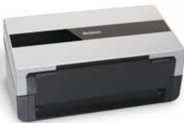
Dust Cover Design