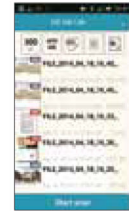
Avision Network Box APP main screen

By connecting the scanner to Avision's newly designed Network Box, the scanner can be upgraded into a wired or wireless scanner to let other computers or smartphones/ tablets to scan and receive image data directly from the scanner in the LAN.